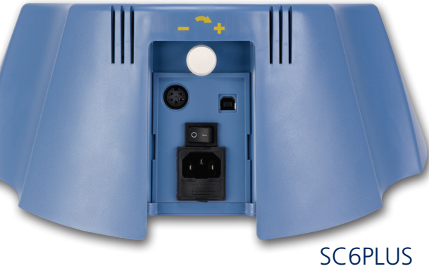
showing printing and PC connectivity